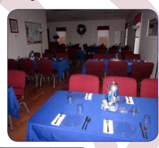
<<The ladies did a beautiful job decorating the room for an elegant evening.